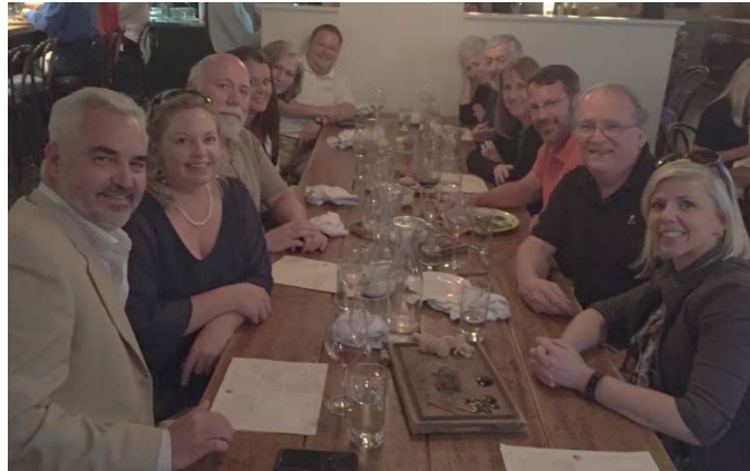
Group Dinner at the 2017 Mid-Year Board Meeting

description of HF/E with a definition, knowledge and skills and job prospects. The board decided to supply an email list of certificants so that they might contribute to the description of their profession. BCPE also supplied core competencies and other supporting documents.