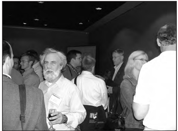
Some attendees of the Tenth Annual BCPE Networking Reception.

BCPE is now recognized as the premier ergonomics/human factors certification body in the U.S., and thanks to your professional contributions and commitments, we look forward to continued growth and influence well into the future.